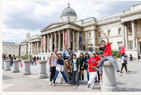
Mill Hill Summer/Spring School